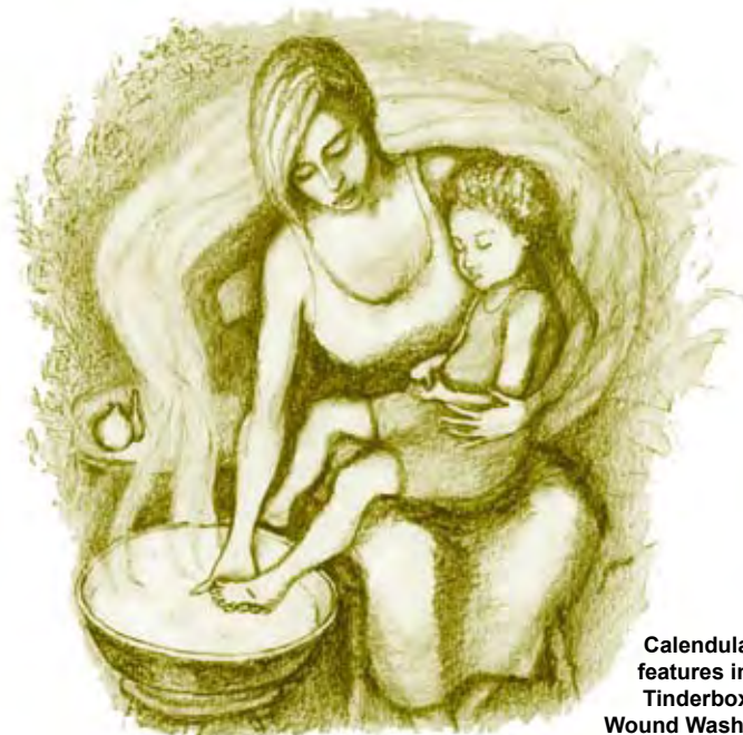
Calendula features in Tinderbox Wound Wash .

Calendula is an emmenagogue with an estrogenic effect which means that it helps regulate menstrual disorders such as delayed or painful menstruation.